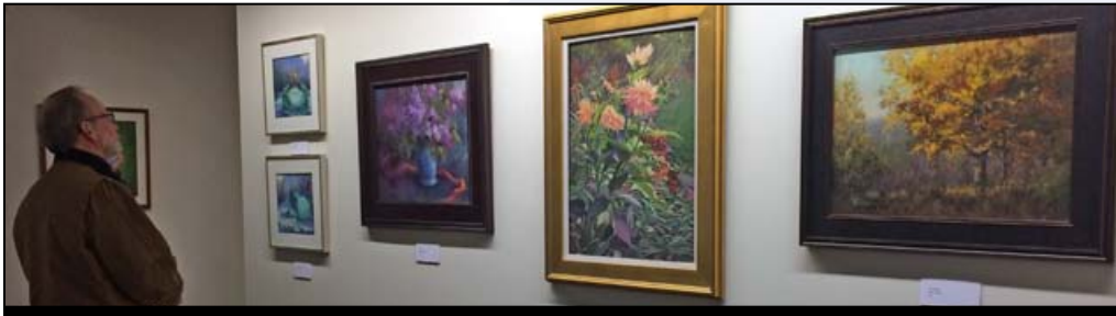
Exhibit Opportunity at the American Swedish Institute