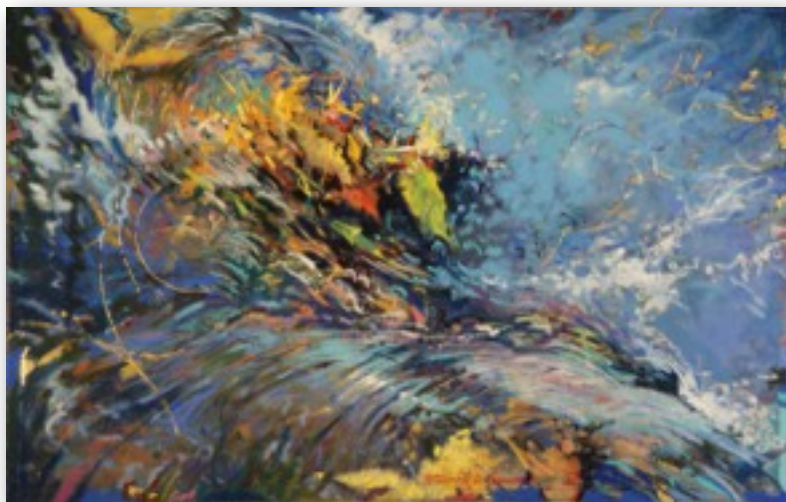
Riding on Rainbows