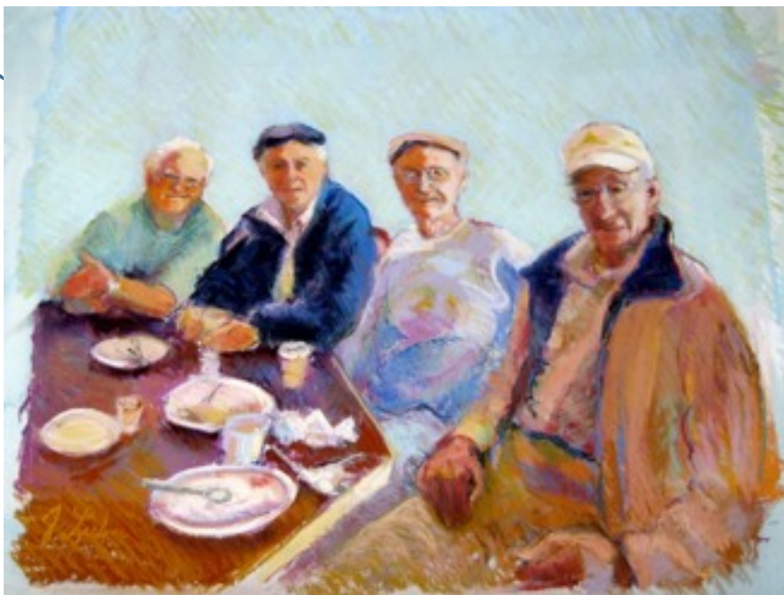
Breakfast At Curran's Restaurant, Mpls

It's exciting to look forward to the new year in eager anticipation of the wealth of remarkable art that will be created by LCPS members compelled to express their poetry. Happy New Year!