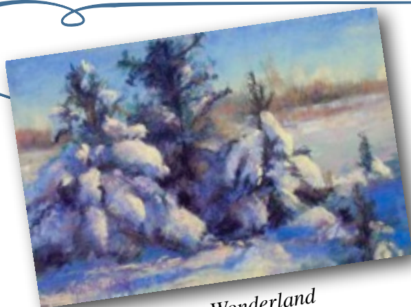
Winter Wonderland pastel on Canson coated paper