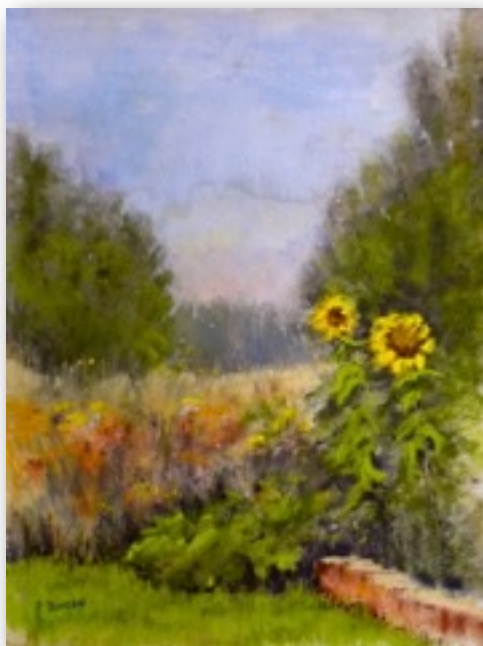
Love Without Exceptions