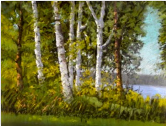
Early Morning Light