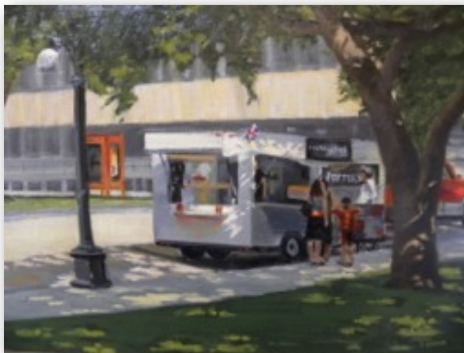
Potter's Pastry and Pies