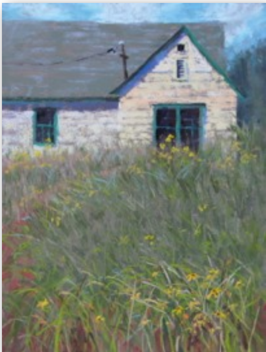
October Comes to Gibb's Farm