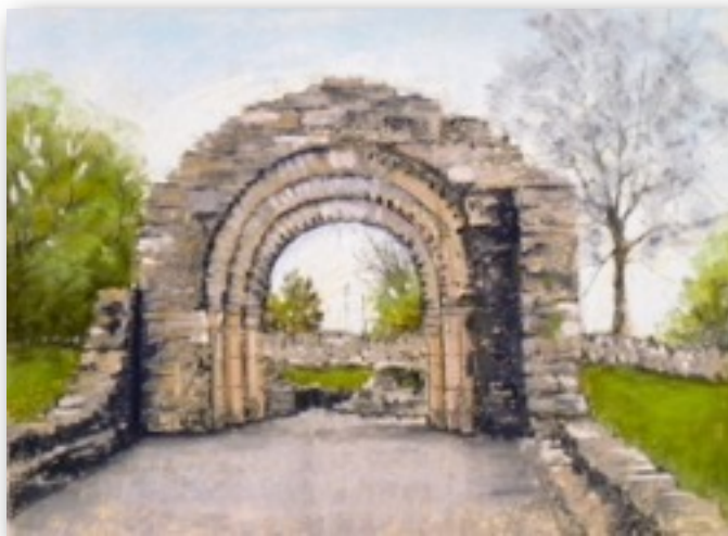
Clonmacnoise - the Remains of a Nun's Chapel in Ireland