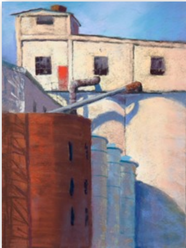
Red Wing Mill