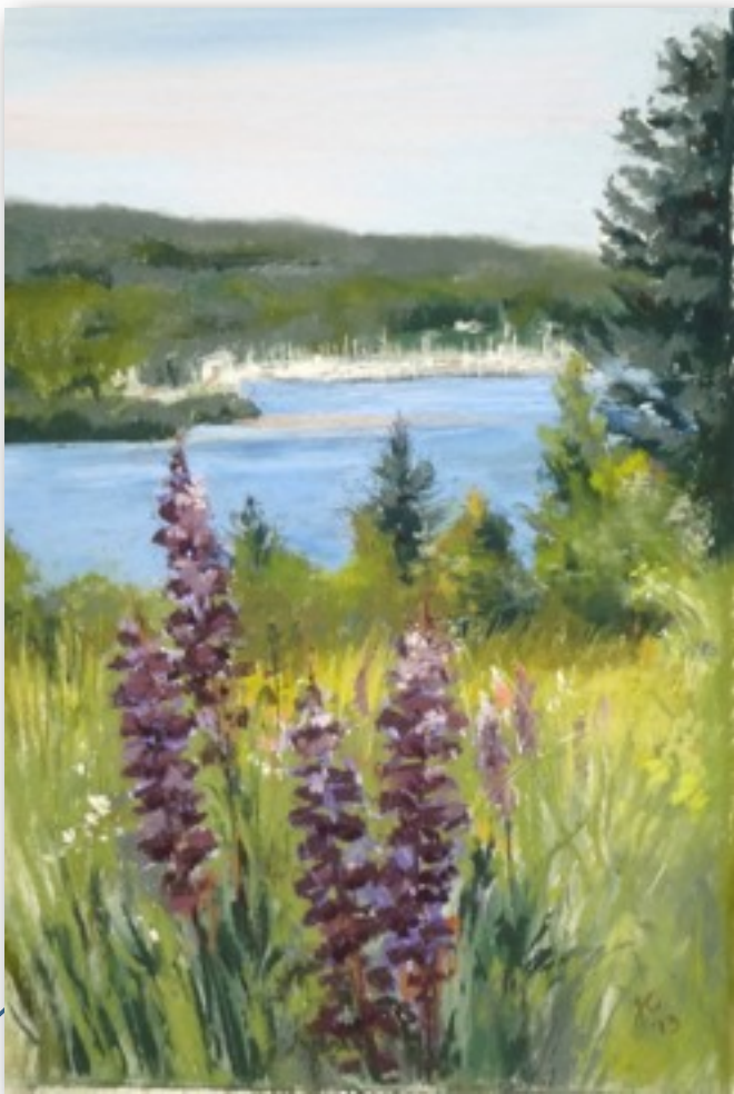
Lupine Overlooking Pikes Bay