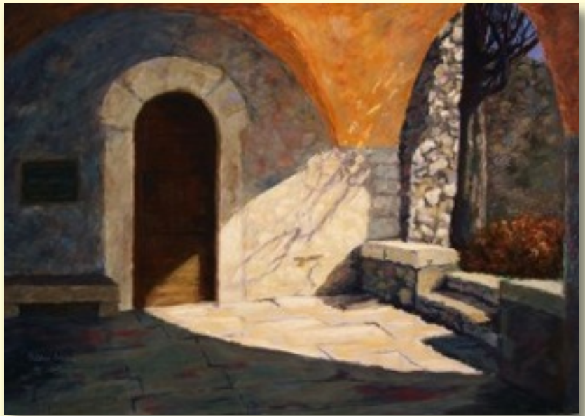
A Sheltered Place

Recently, she made a permanent move to Minnesota from her home in Pennsylvania to be near children and grandchildren.