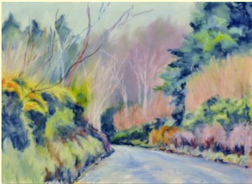
Country Road in Ireland