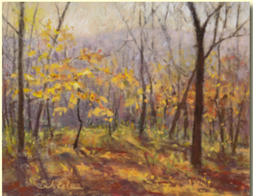
Chasing the Light