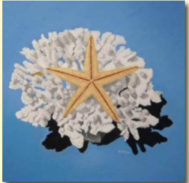
Coral and Starfish

The coral and starfish in the accompanying picture do tell a story. They were collected while walking with my daughter on Florida beaches. To me, it brings back memories of collecting shells on a bright and sunny day, and being amazed at the variety that nature provides.