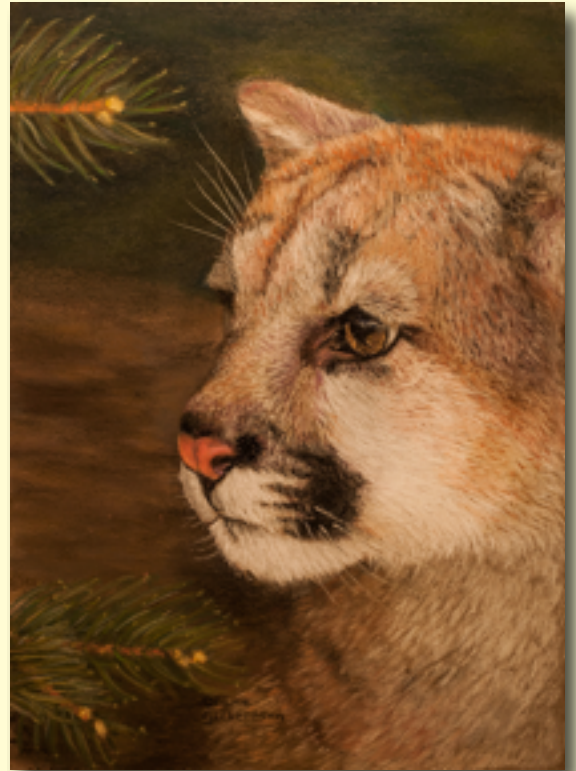
Cougar in the Pines

I have a husband, and two grown sons who live in San Francisco and Portland, Oregon.