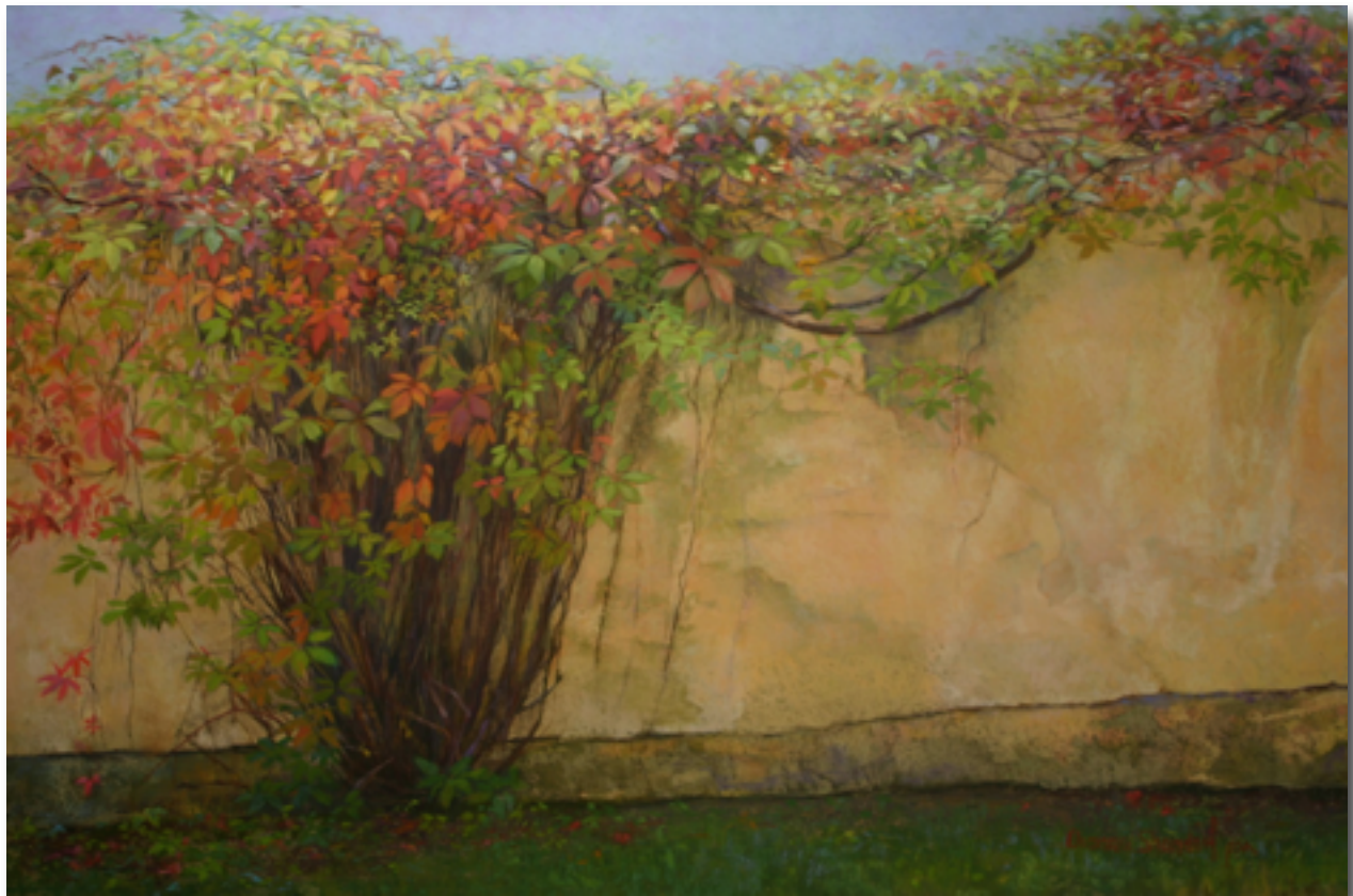
~ Czesky Wall ~