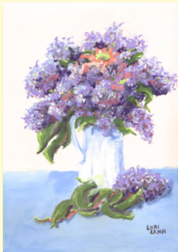
Lilacs in Ewer