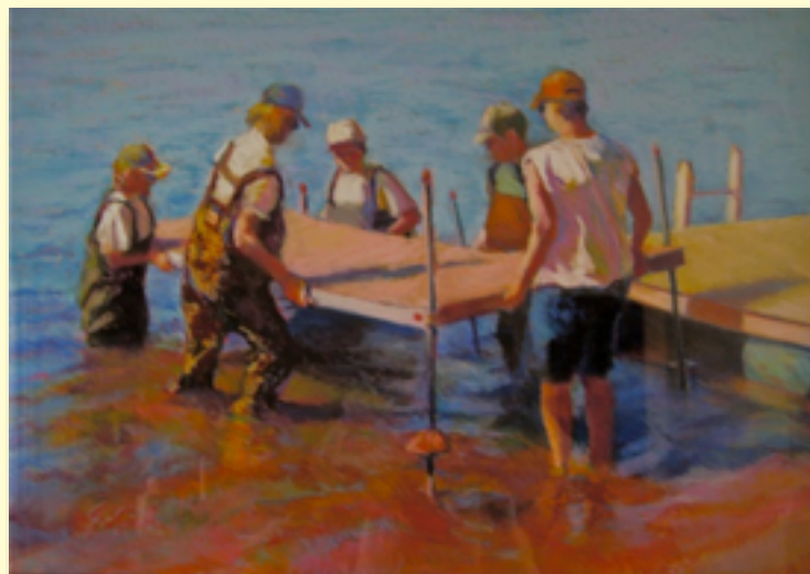
One, Two, Three... Lift!