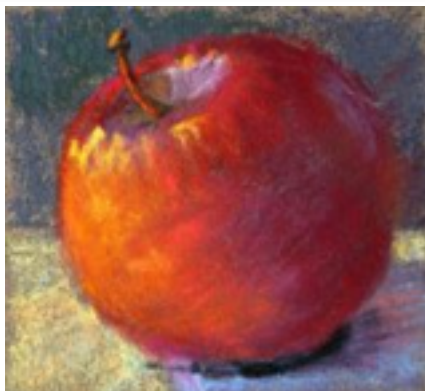
Loosing My Marbles