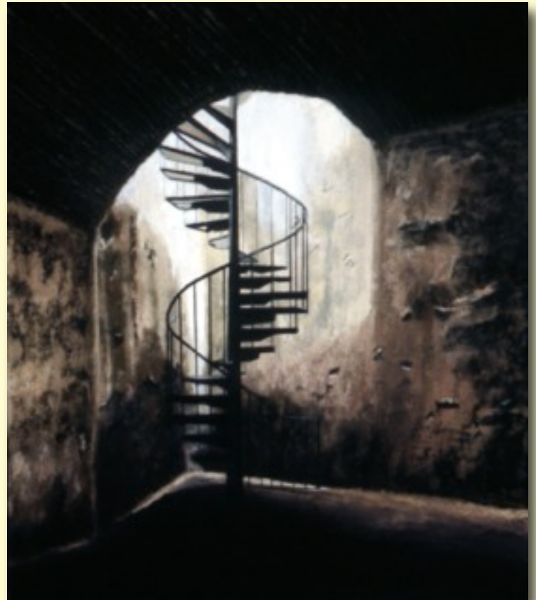
Into the Light

I also belong to our local Art Association here in Lancaster and have entered the member shows, juried shows, and have even won some awards and sold some paintings. But for me the best part is just in the "doing". And in attending workshops I am making new friends and catching up with the old ones.