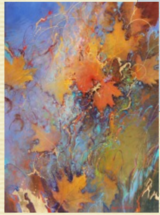
Through Gates with Laughter 24 x 17 1/2" 2015