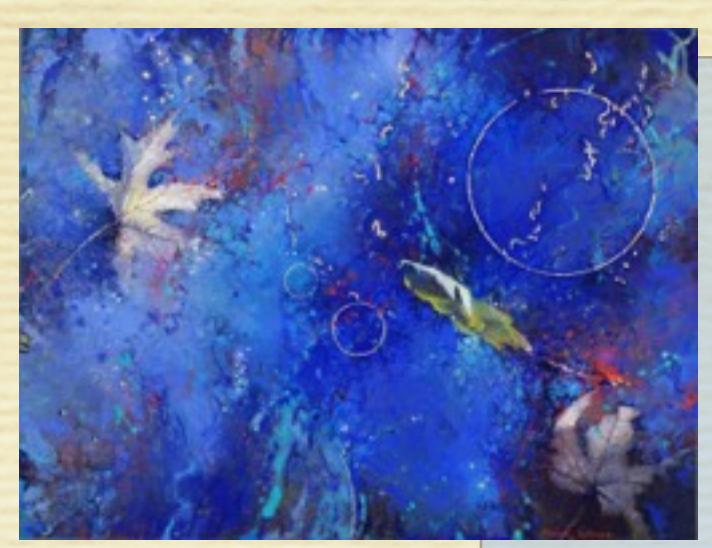
Beyond Blue 18 x 24" 2015