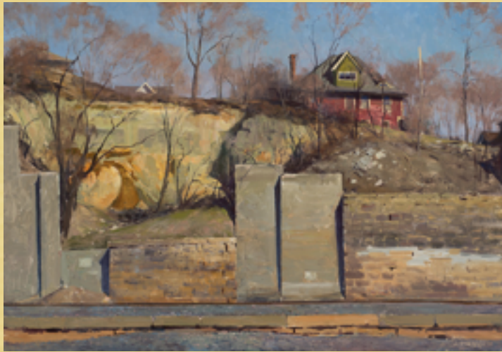
Organic Geometry 28" x 40" $19,500 - SOLD