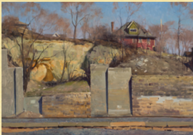
Organic Geometry 28" x 40" $19,500 - SOLD