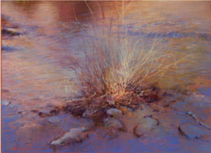
Best in Show "Radiant Laced Waters" Fred Somers