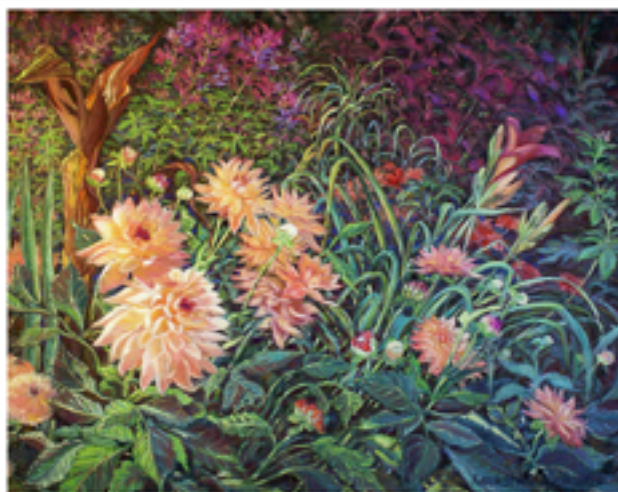
"Oh, The Way We Grew!" Accepted into the 2015 Pastel Society of America 43rd Annual Exhibition: Enduring Brilliance. National Arts Club, 15 Gramercy Park So., New York, NY