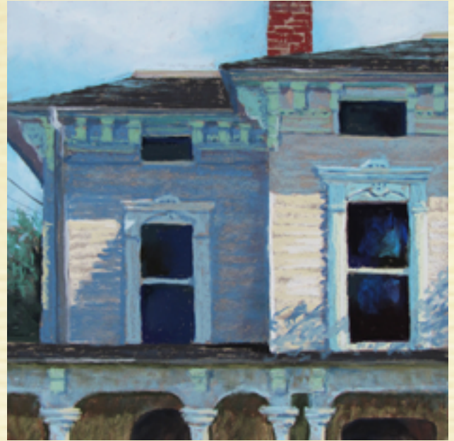
First Place "Blue Belle" Lisa Stauffer