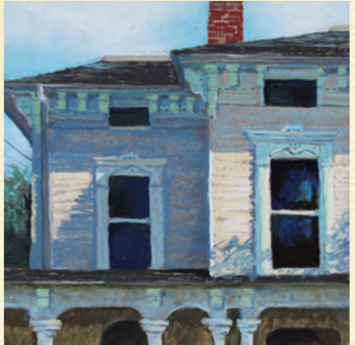
First Place "A Certain Symmetry" Lisa Stauffer