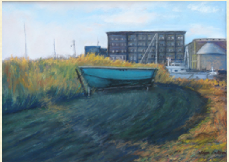
Third Place "Superior" Sher Leksen