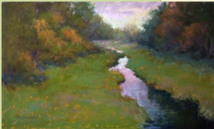
"Gray Day on the Rush River"

Started in 1940, the Wisconsin Regional Art program was established to encourage Wisconsin citizens with a serious interest in art. People who make art purely for the love of it, rather than for fame and fortune. The purpose of WRAP is to encourage artists to develop their abilities. This year, we celebrate over 75 years of Wisconsin art.