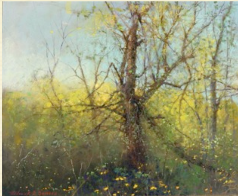
“Blooming Spring”

New Brighton Community Center, New Brighton, MN