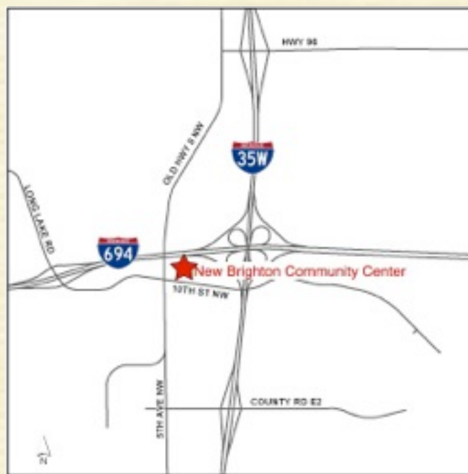
New Brighton Community Center 400 10th St. NW New Brighton, MN 55112

We seek to unite artists from beginner to professional who are interested in the pastel medium and to serve their needs by encouraging artistic growth and development through education and sharing. We also work to create public awareness of pastel as a unique and beautiful art form.