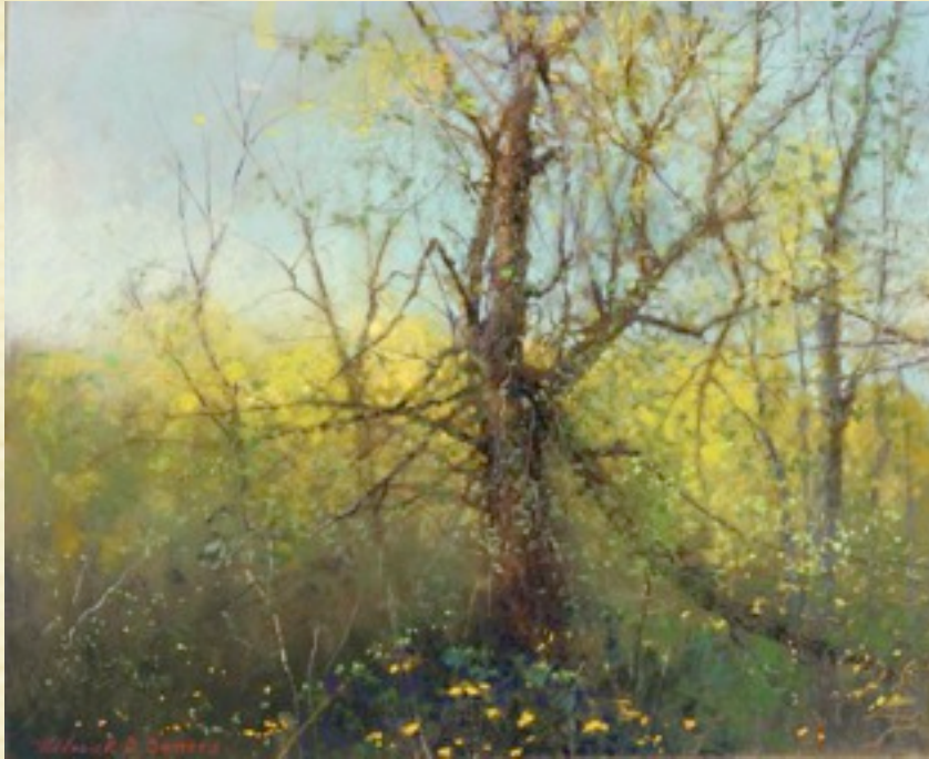
“Blooming Spring”

New Brighton Community Center, New Brighton, MN