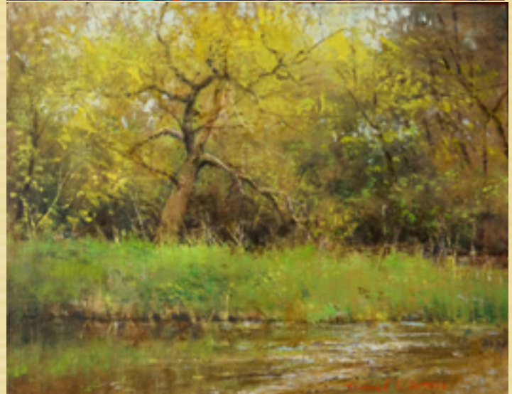
Cadmium's Last Touch Oil on Panel