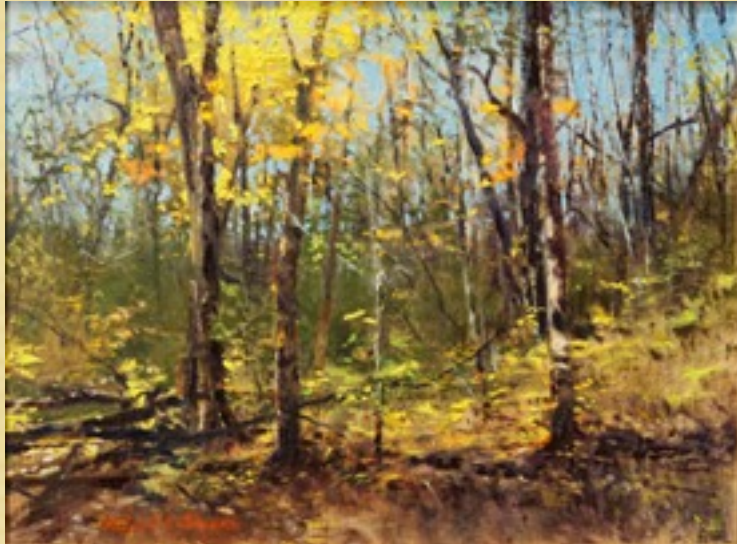
Plein Air Magazine 6th Annual Plein Air Salon Dec/Jan Shaped by Time Oil on panel

International Association of Pastel Societies 4th Masters Circle Exhibition Timeless Wonders Pastel on Canson