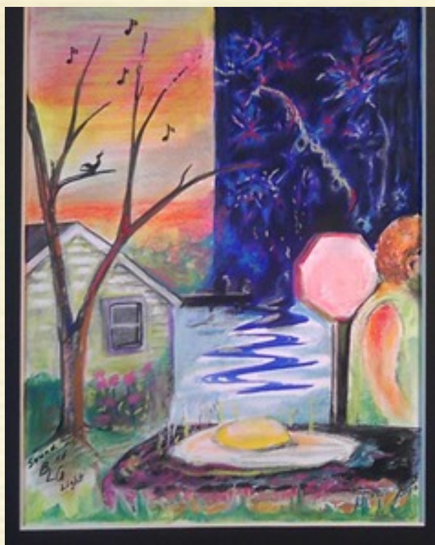
"Sound of light"

4th topic was "the sound of light" which generated a variety of projects including poetry about plants quietly growing with a painting of emerging plants. I thought of lightning first, then the light/sound on the first atom bomb test, but wanted more pleasant subjects, and ended up with a composite piece painted with pastel, watercolor, acrylic & watercolor brush pens with subtitle "Birdsong, Starburst, Ouch and Sizzle". The painting won an honorable mention in our Nobles County Art Show.