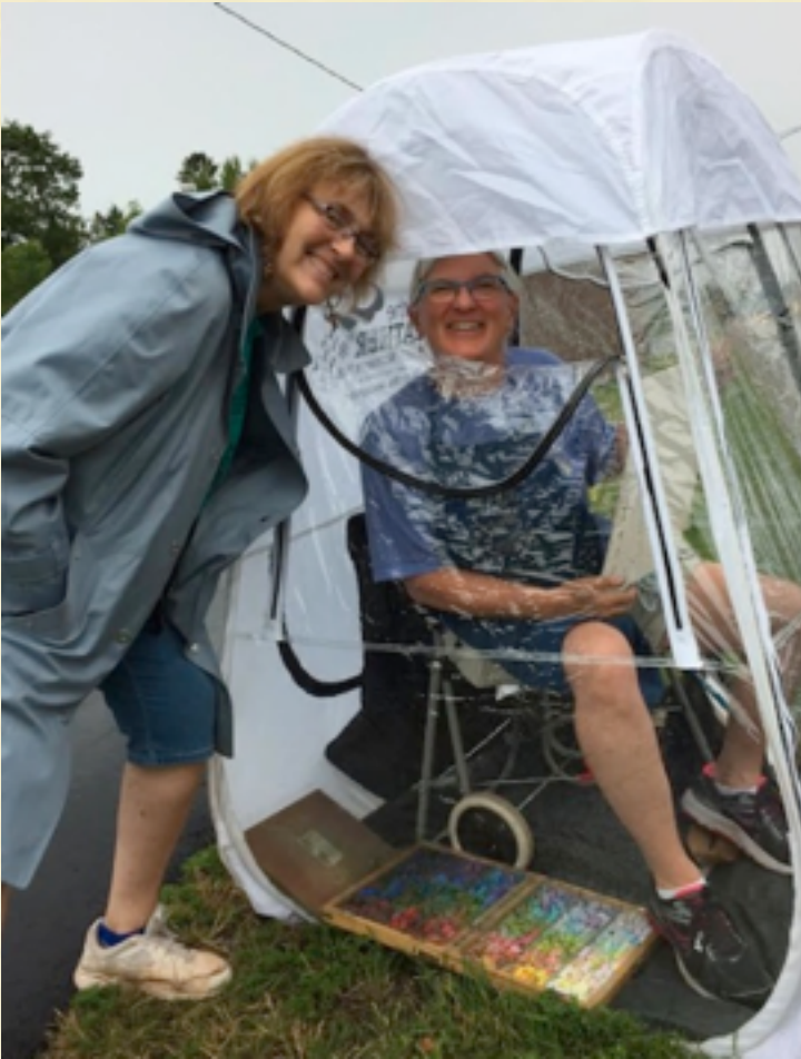
In my shelter being visited by a painting friend in a break from the rain.

The rain did not stop me from painting! In my portable pop-up shelter I was able to paint when threatened by mist or rain. Luckily I had to use it only one day.