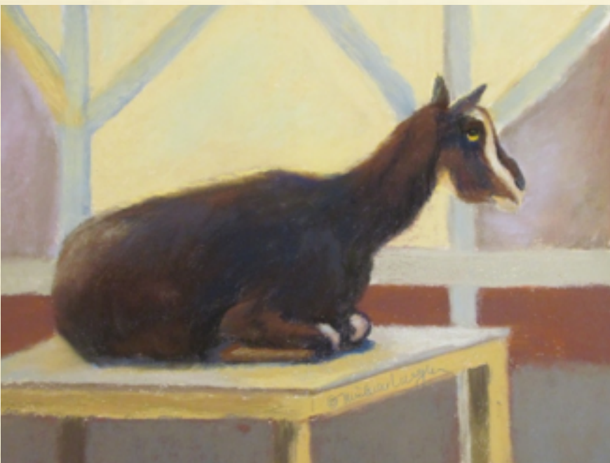
“Whose got my goat?”

The goat was painted during the Quick Paint at the local zoo. Artists had 90 minutes, start to finish, to complete a painting, and capturing a moving animal was quite the challenge. Happily, this one decided to take a break from usual goat-business long enough to pose a spell.