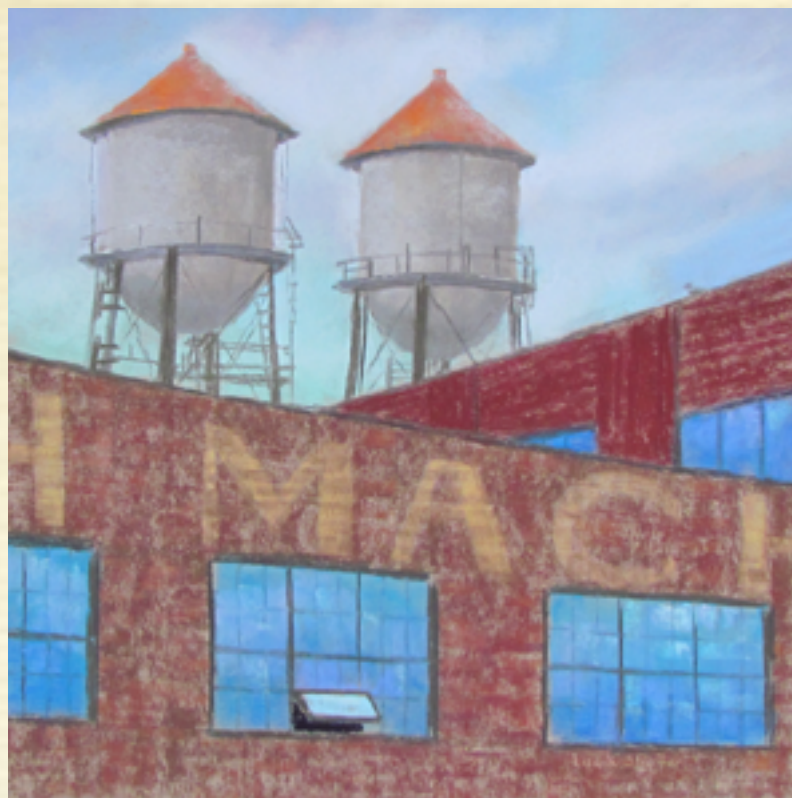
"Zenith Machine" Honorable Mention- Sense Of Place