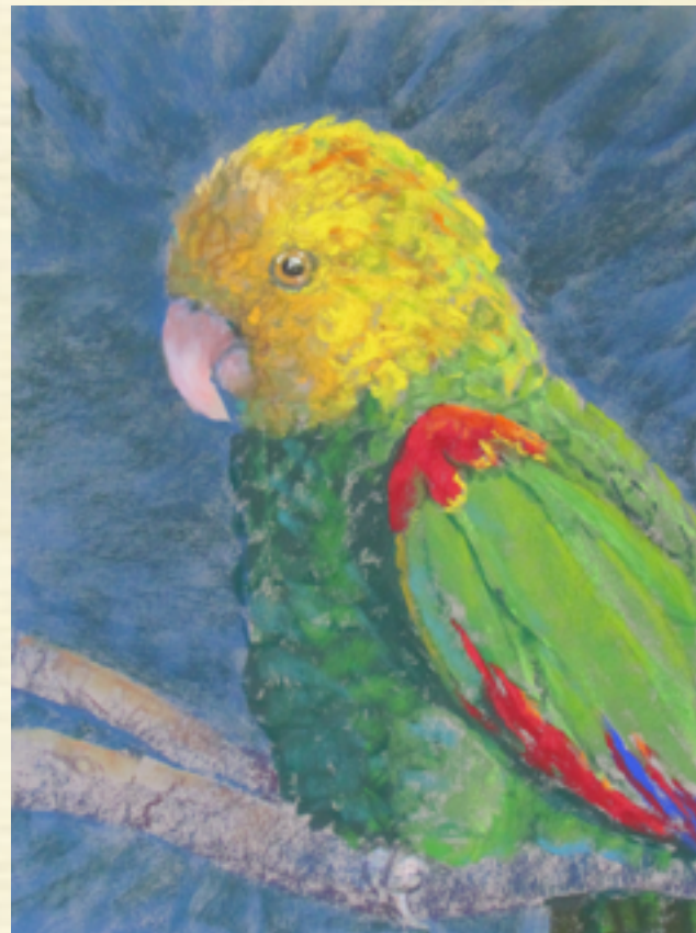
"Perched For A Chatter" First Place- Quick Paint

We chatted throughout the 90 minute time, and she changed her perch many times to add to the challenge, but we both had a great time- I know we said hi and hello many times and made noises and sang a bit, I am not sure what else we discussed but I had a friend by the end!