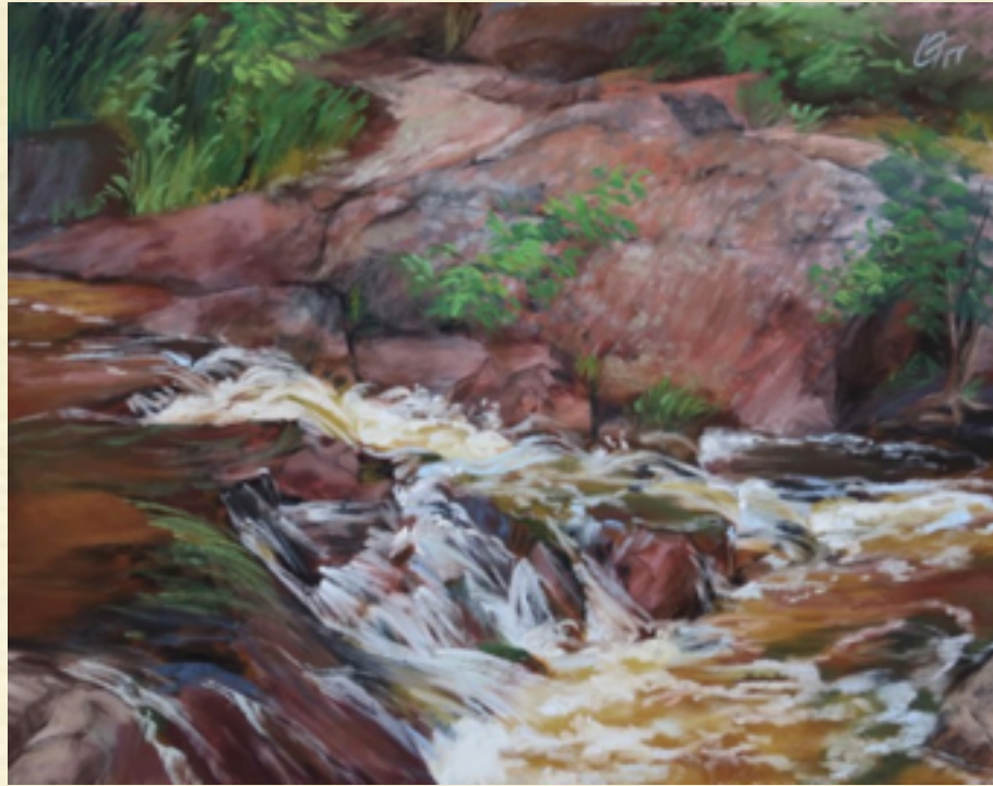
"It's A Gorgeous Life"