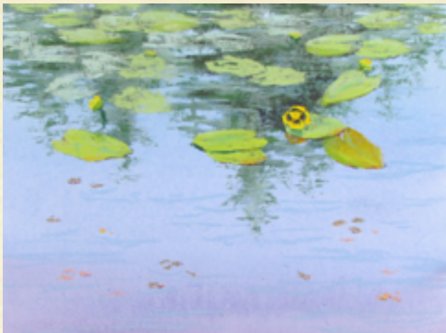
"Quiet Day on the Pond"

I was drawn by the bold abstract formed by the old water towers against the sky set off by the sky reflections in the windows of the old machine shop and this was an interesting subject to paint with the sharply angled perspective. I also liked the old towers and machine shop lettering and brick contrasted with the new condo windows set in to the old walls.