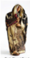
Barb Riegel Bend