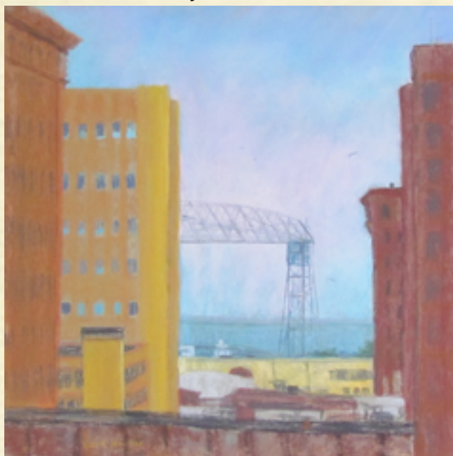
"3rd and 3rd"

The quick paint at the zoo this year was a departure from the pure landscape. I was out looking over the residents and rain was threatening, it had rained several times this week already and I paint in pastel so I went inside the buildings and found this beautiful Double Yellow-headed Amazon parrot.