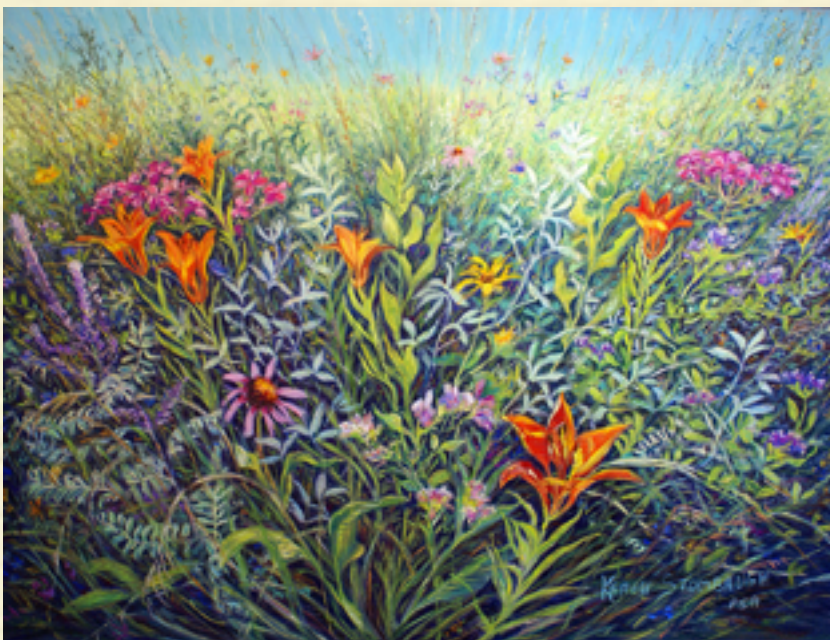
"Wood Lillies in the Best of Company"