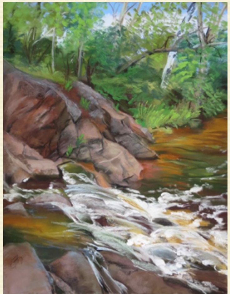
"Above the Swimming Hole"

That's why I paint; to share the joy of being alive in this beautiful world.