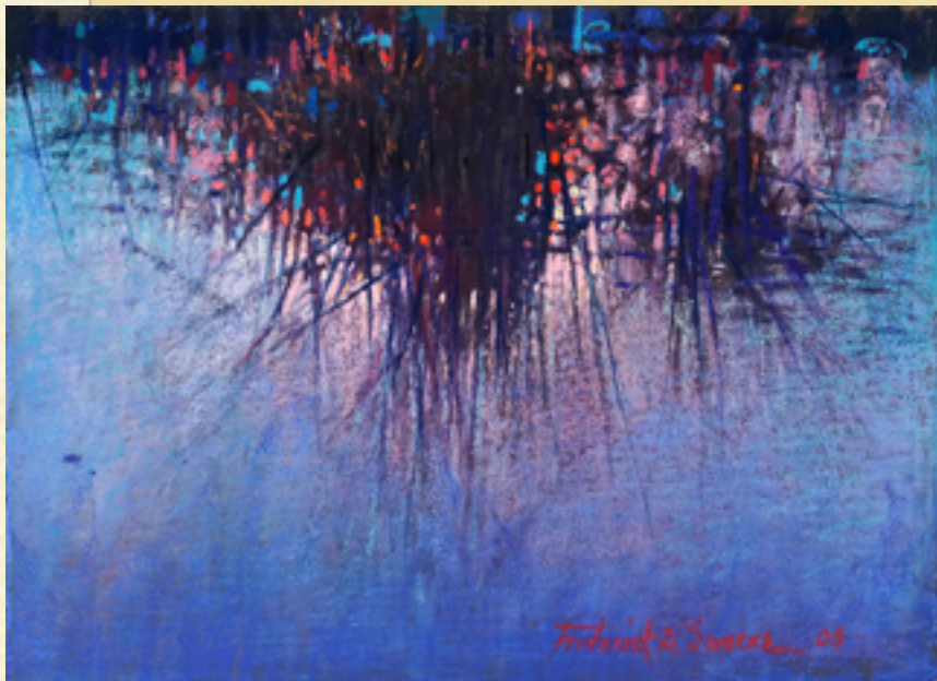
"Ruby's Crowned Waters"

Abstraction: A Celebration of Contemporary Art , includes two of Fred's pastels: " Ruby's Crowned Waters" and "Rainbow's Laughter"