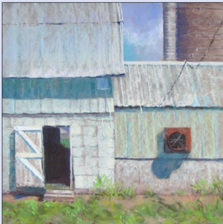
In to the Barn

Pastel Societies of the Midwest Award — donated by Central Pennsylvania Pastel Society, Chicago Pastel Painters, MidAmerica Pastel Society and Lake Country Pastel Society.