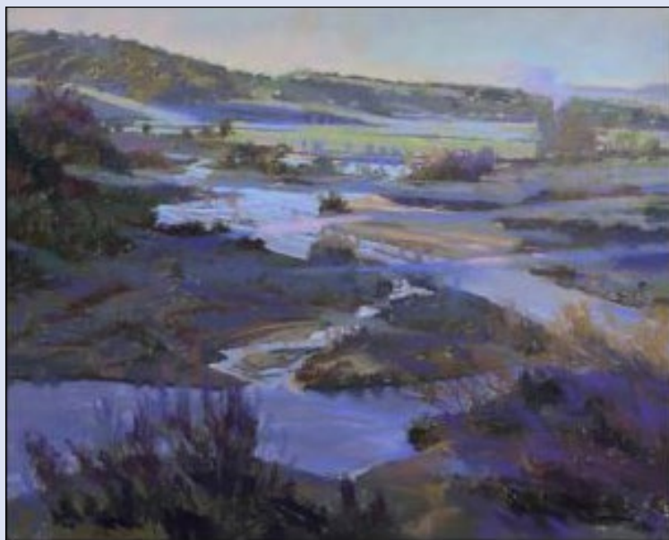
Salinas River at Daybreak