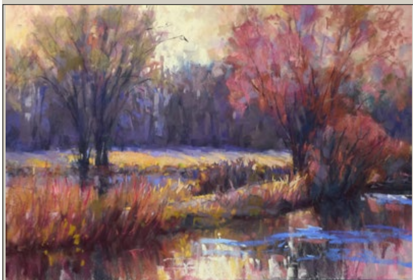
Path Across the Pond