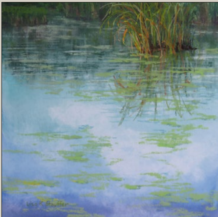
Summer On Pleasant Creek