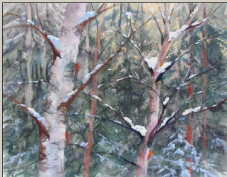
Morning Has Broken