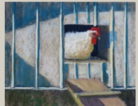
In And Out

Consider coming to Grand Marais in April to join me and other enthusiastic painters for Stilllife In Pastel, April 3-5, and Advancing In Pastel, April 6 & 7.