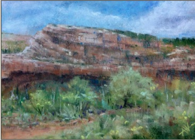
On The Girdner Trail, Sedona

I am grateful for the warmth and sun in Arizona. These paintings are a few scenes from a previous visit. Not quite as green now as depicted in these paintings, but certainly greener than Minnesota.