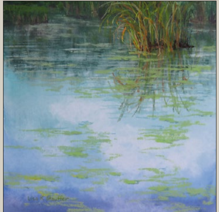
Summer On Pleasant Creek

My painting, Summer On Pleasant Creek, won Third Place Pastel at Art Of The North's (new name) Annual International Show at Hopkin's Center For The Arts. This painting will be included in the Traveling Exhibit which will be on display at the American Swedish Institute from February 22 — Sunday, April 24, 2019.