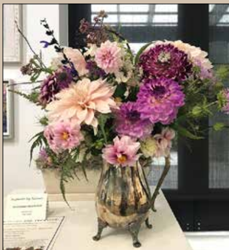
The Mahtomedi Garden Club had some gorgeous floral arrangements in the gallery and much more for garden lovers.