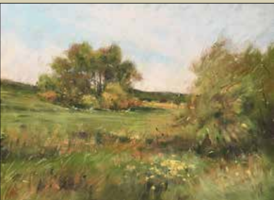
Honorable Mention — “August Landscape” by Art Weeks

Beautiful brush work as move through the landscape, beautiful edges.