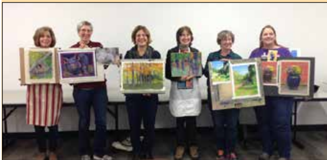
Last year's Paint-Around participants and finished paintings.