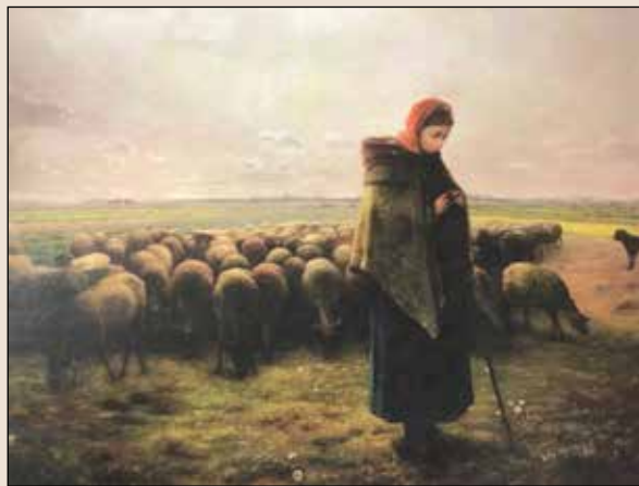
Jean-Francois Millet, 'Pasture' , pastel

welcoming to female artists in of her time. Because she was a woman she had more access to mothers and children. This subjects she portrayed in both oils and pastels. We learned that she was a rebel in many ways, and that she did a whole series of women reading newspapers!