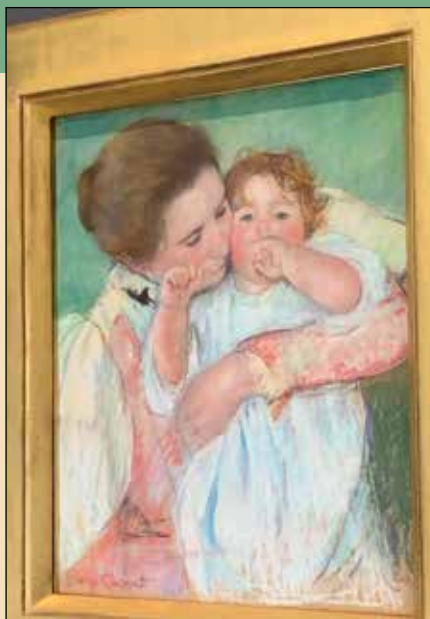
Mother and Child 1897