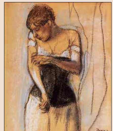
Edgar Degas, pastel sketch