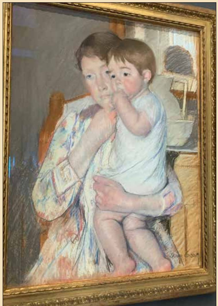
Mother and Child against a Green Background (Maternity), 1897; pastel on beige paper mounted on canvas