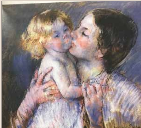
Mary Cassatt, A Kiss for Baby Anne (no. 3) , pastel