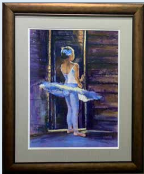
3rd Place — Pat Duncan "Waiting My Turn" Framed size: 24" x 30"

"The title of the painting conveys that tension you would feel before going out on stage, and it shows in her body." Rick loved the changes in light and how it changes when it comes through something (the material). The texture in the wood was very interesting also. "The color harmonies are very nice and the presentation is very beautiful — it fits the piece very nicely."