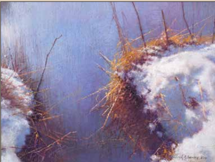
First Snow, Golden Threads