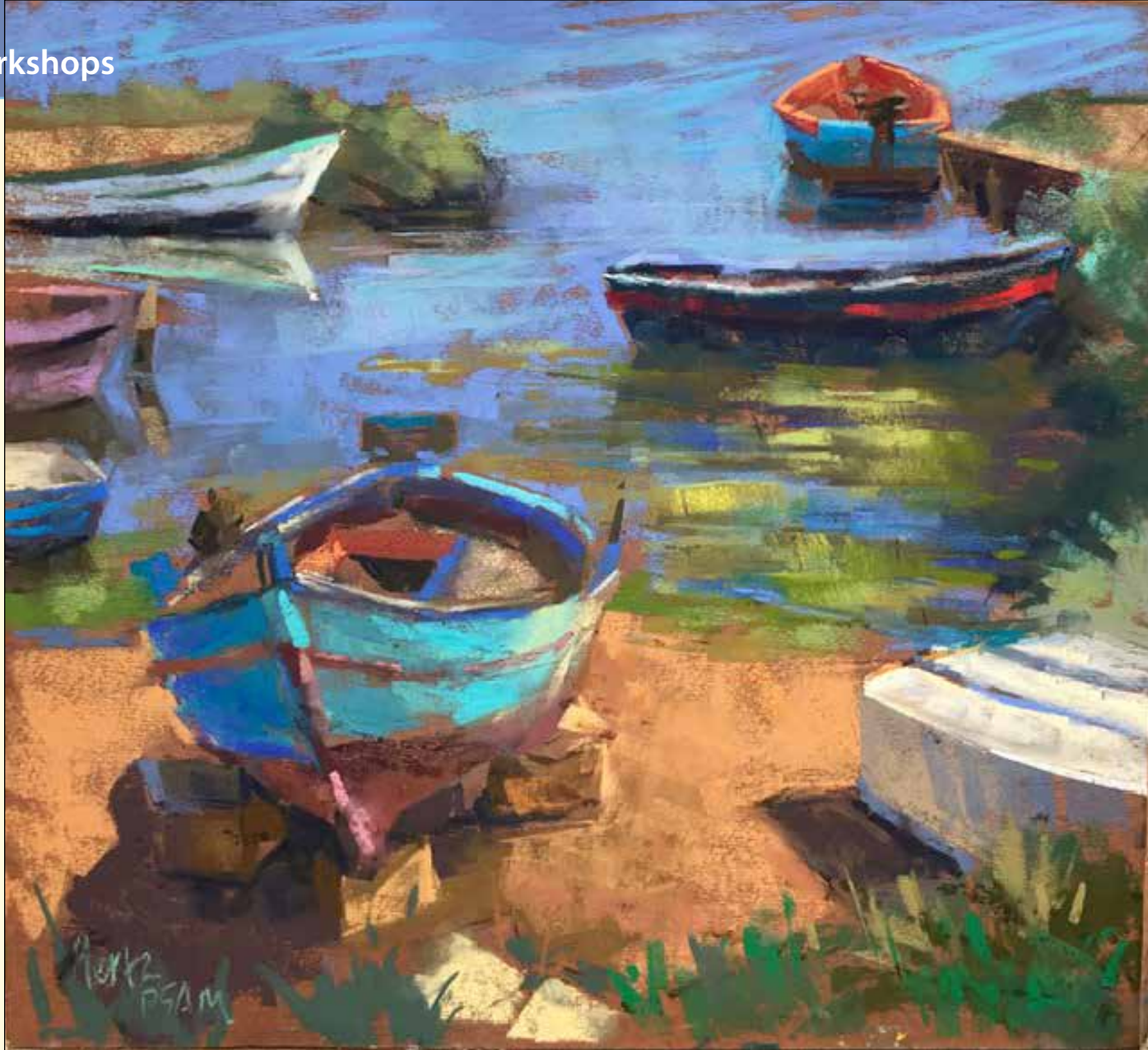
Fishing Boats at Marsala