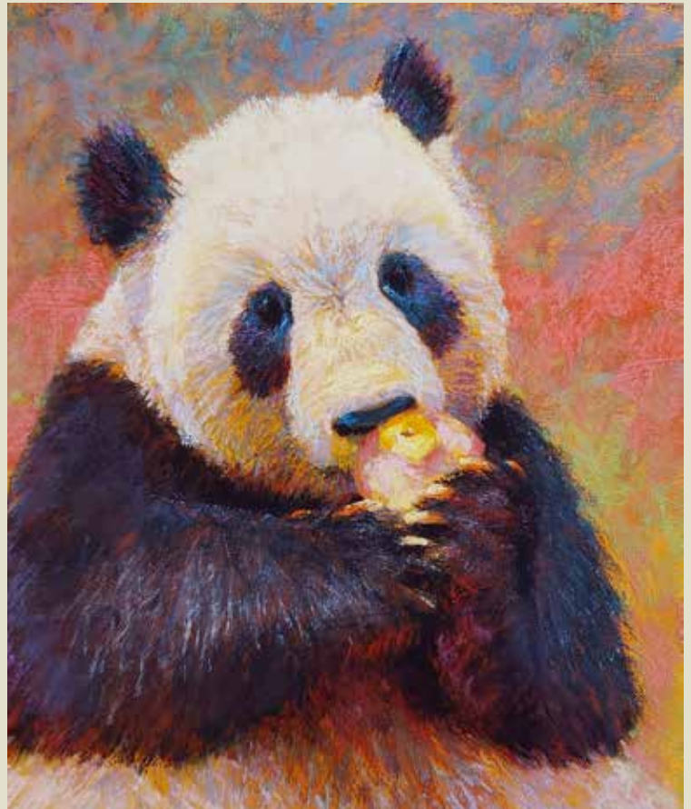
Warm Fuzzy #26 - "Panda Eating an Apple" (pastel, 10x8 inches)

We shall see! I'm currently working the kinks out of my techie video setup and waiting on the last couple bits of equipment. (also waiting for our A/C to get fixed, ugh!) Send me a message if you'd be interested in being on the waiting list for my first online classes, workshops or open studio days! rita@ritakirkman.com .