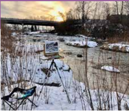
Winter Falls - field to final