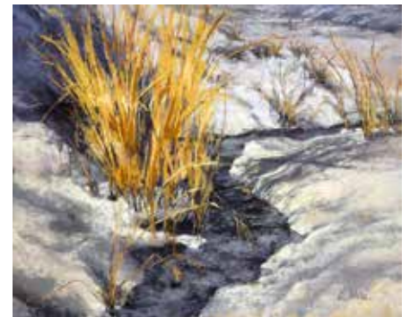
Winter Golden Grass