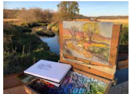
Trout Bridge - field to final