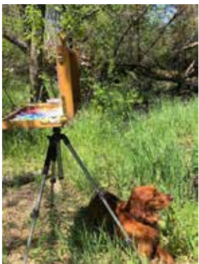
A beautiful day at Spring Creek

I enjoy painting from real life- en plein air, being immersed in the landscape with all senses heightened, but a limitation is the need to work in a small format. Enlarging a painting while maintaining the energy and freshness of the smaller version done on location can be difficult. My plan has been to take on this challenge, create larger works and achieve a new level of painting skill.