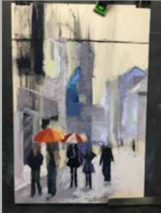
My work in progress