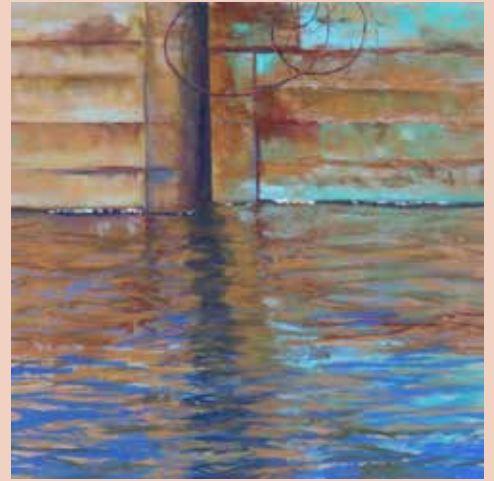
Mississippi Barge 12X12

White Bear Arts has a beautiful international plein air show that is online as well, I had 2 pieces juried into that show. Perfect For Pigeons and Mississippi Barges. View the show at whitebeararts.org .