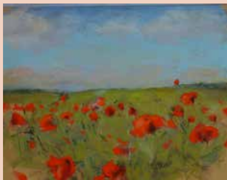
Poppies in the Canola 12x16