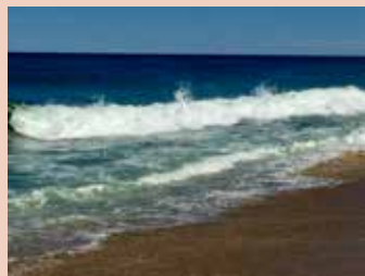
Inspiration for future works!