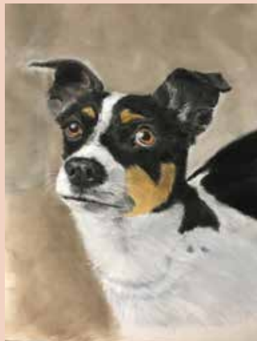
Charger Sees Treats 8x10