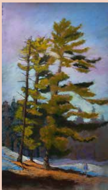
Not Quite Spring

michelleweglerart.fineartstudioonline.com