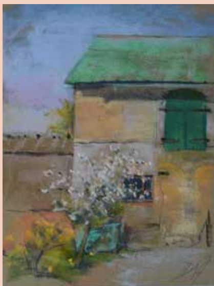
Greens in Spring 16x12