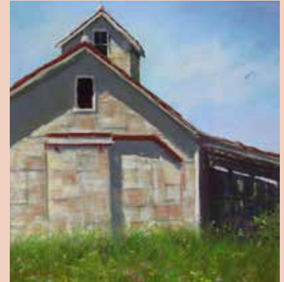
Perfect For Pigeons 12X12

Birch and Maple leaves are gorgeous during our northern fall. Bring some of your best photographs of the season with high contrast, and we will discuss composing a painting from your pictures. Class time will include painting basics, instructor demonstrations, personal assistance, group critiques and lots of fun! We may find time to experiment with underpaing also. A variety of pastels and papers will be available for purchase from your instructor.