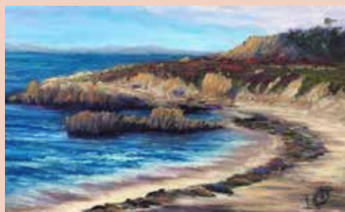
Sea Lions sunning at Año Nuevo 4x6 on Pastel Premier