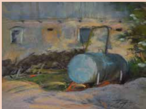
Blue Farm Tank 12x16