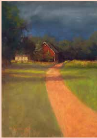
Changing Skies 12 x 9