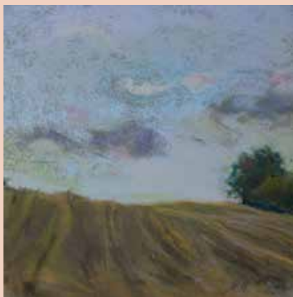
Field in Mjang 12x16