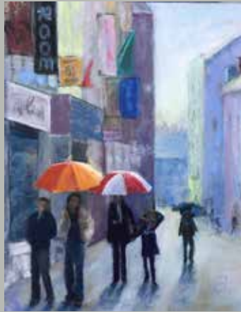
My final version of Nancie's demonstration - Galway