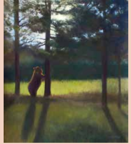
Peek-a-Boo Bear 20 x 16