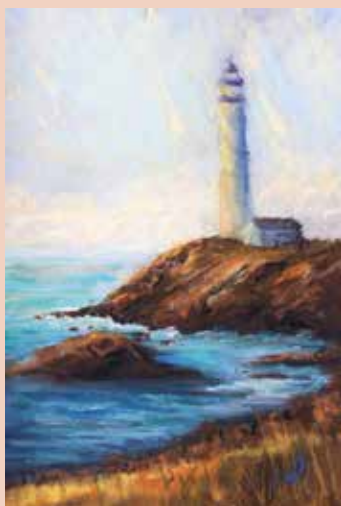
Pigeon Point Light Station 6x4 on UART 400

My hometown, Santa Cruz California has been battling devastating fires in the nearby mountains. With my family and friends on my mind, I just completed two small paintings done from old photographs of an area hit especially hard.