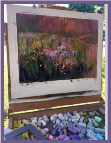
My work in progress