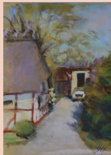
Flag on the Shed 6x6