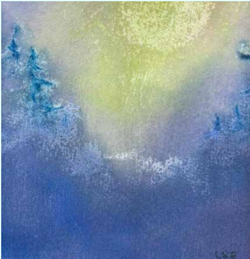
Initiation, 4" x 4"

I am pleased to share that my submitted piece was accepted in the Selected Associate Member Art for the HAPPY NEW YEAR blast from PSA!