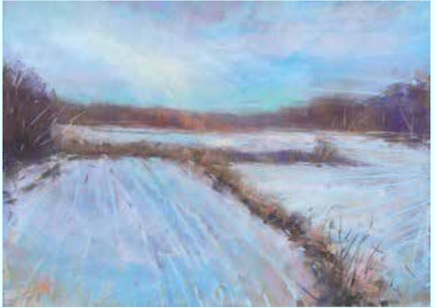
9" x 12" Pastel on U-Art Paper, 'Untitled'

Despite the toll Covid-19 has taken upon the world, the snow in this serene setting does in some respect reflects the beauty in the thousands of doctors, care givers, first responders, nurses, police and fire fighters who put their lives on the line every day.