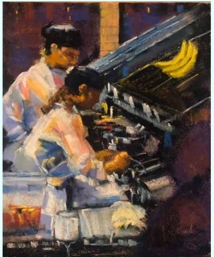
Spoon and Stable

My piece, titled "Spoon and Stable" has been accepted into the PSEC Societie de Pastel de l'est du Canada (The Pastel Society of Eastern Canada). I am honored and humbled to have this piece selected for the International show of Eastern Canada. The exhibit can be viewed online at the PSEC website. www.pastelsec.com starting Dec. 15th.