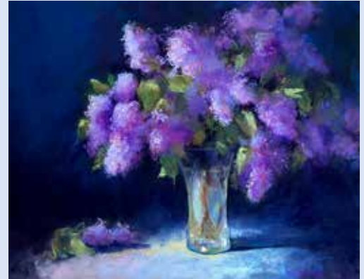
16 X 20 Lux Archival paper