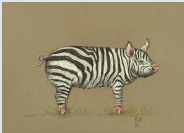
Z-Pig 12 x 9 Canson paper