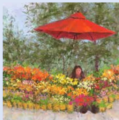
Farmers Market Flowers