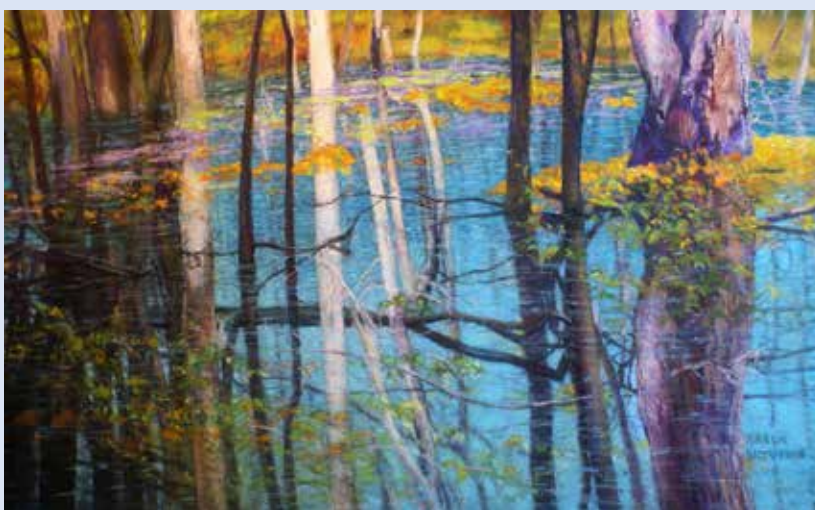
Color of Water, Dreamscape Series #9