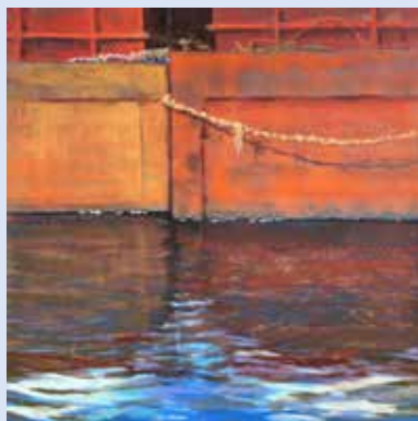
Barges - Loading On the Mississippi