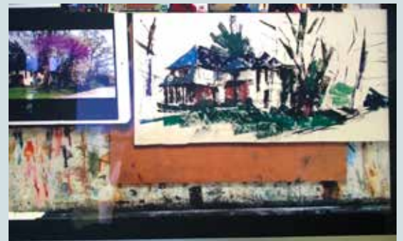
Setting underpainting with Denatured Alcohol