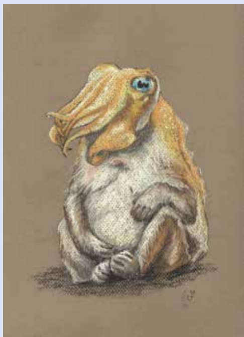
Sea Monkey 9x12 Canson paper