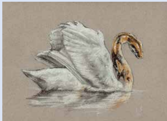
Swan Snake 12 x 9 Canson paper