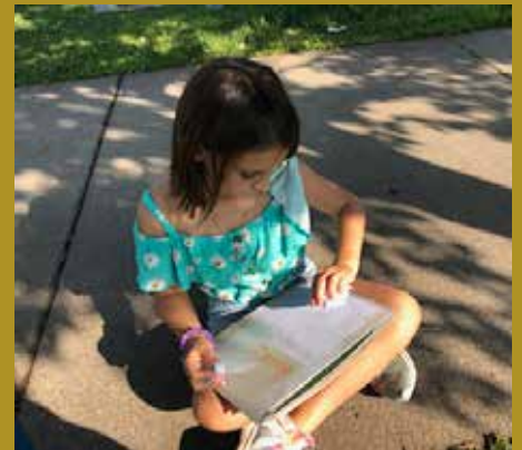
Future LCPS member?

Looking for more Plein Air opportunities? Check out these events: