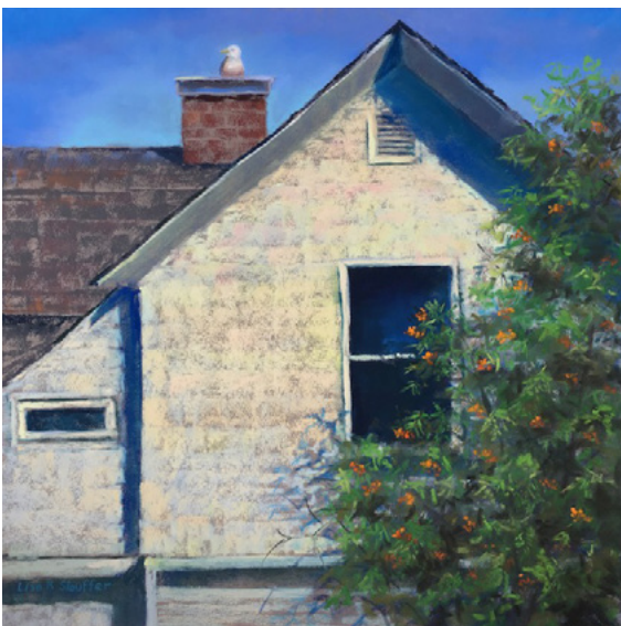
Museum and Mountain Ash 12 x 12

“Bowing Birch” and” Old Red Leaning” were juried in to the MidAmerica Pastel Society’s 2022 National Exhibition. “Bowing Birch” won an Honorable Mention at the show.