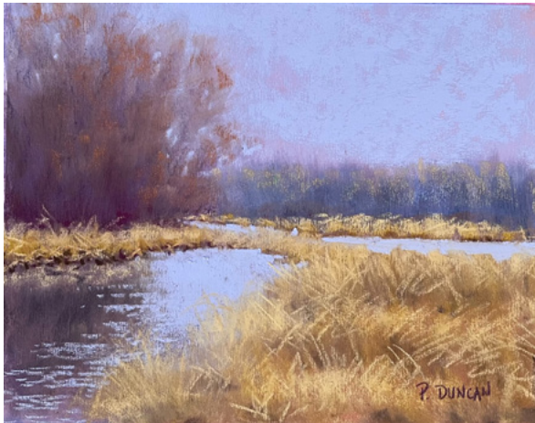
“Meandering” (Apple River) 10 x 8

I had the opportunity to stop by to see all of the beautiful artwork on display at this fabulous venue!